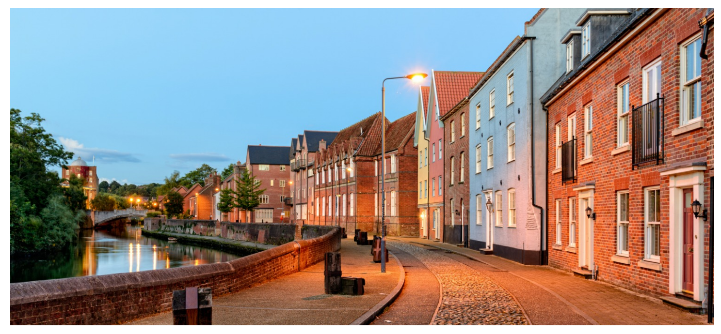
Overlooking the River Yare in Norwich, a city which can represent good value (see page 5).

"East of England is top performing region in terms of prices, up 5.9%."