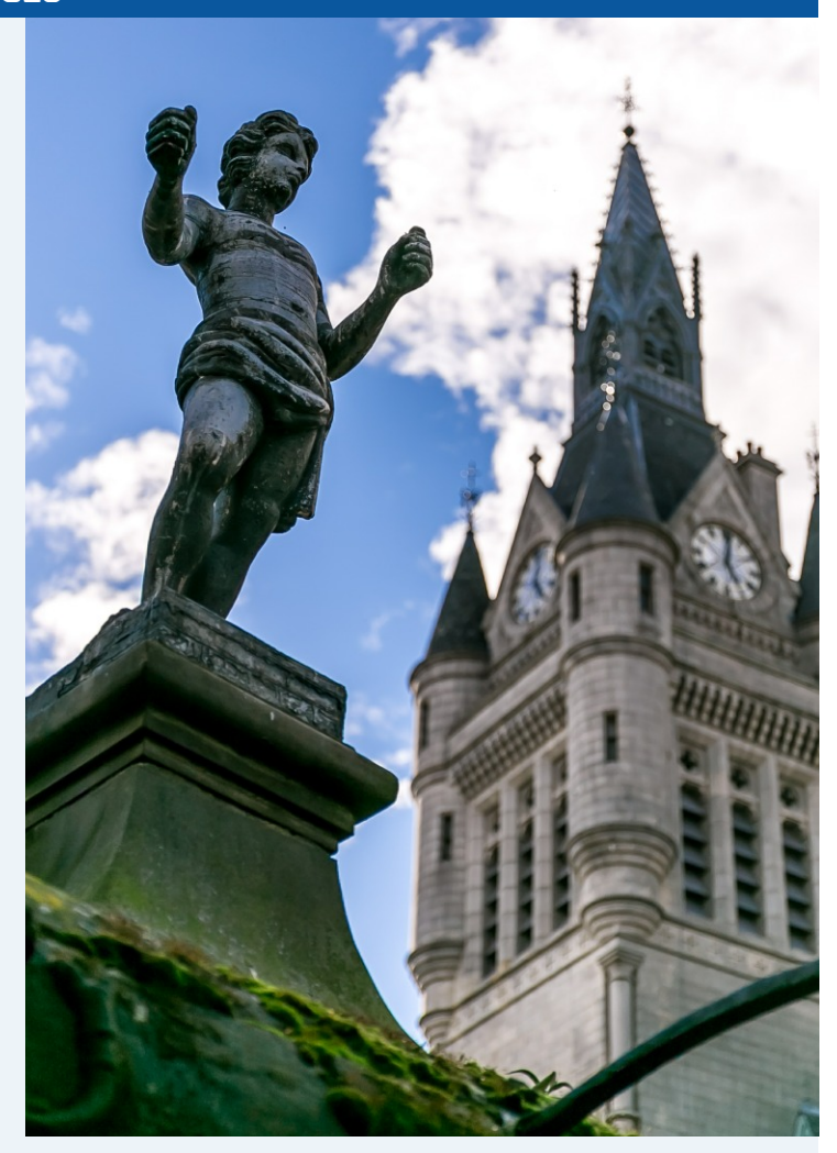
Aberdeen's economy has suffered due to the loss of revenue in the oil industry.

The exception to this is Aberdeen which, like most cities in Scotland has its own local economy driving prices (and rents). Normally Aberdeen bucks the trend when it comes to price and rent rises, always rising at higher rates than anywhere else and it's an area that didn't even really suffer that much when the rest of us were seeing huge falls during the credit crunch. However, over the last few years, the sustained loss of revenue in the oil industry has meant the economy has suffered and when people's jobs and company's revenues and profits aren't performing, so the property market under performs. This is why Aberdeen is now seeing prices 7% lower than they were in 2007 and still 3% lower year on year.