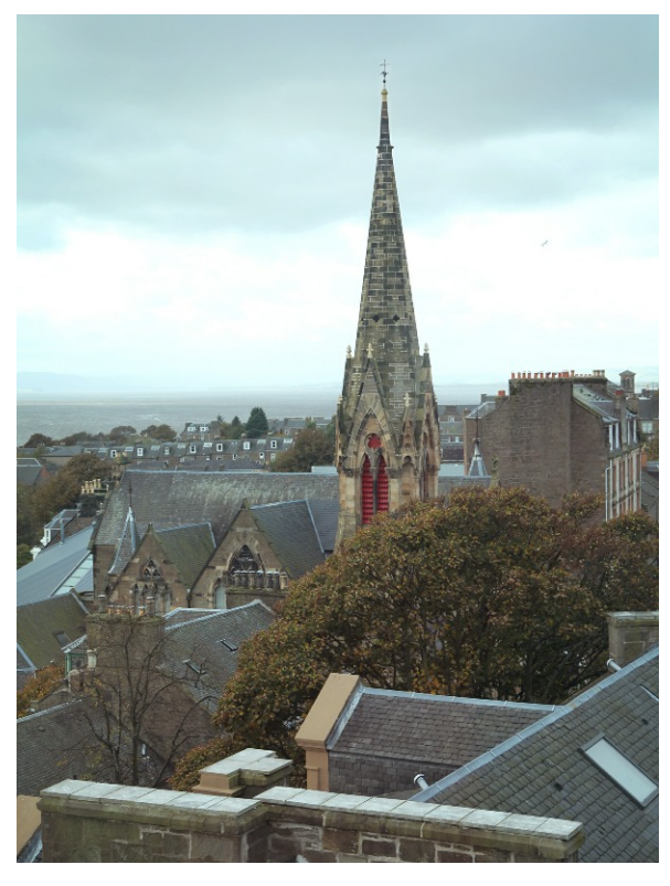
Dundee has hardly seen a price change in the last 10 years. More on page 5.